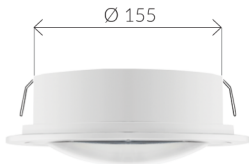
Set pour montage encastré option with recessed mount kit applied