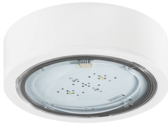
Dimensions [mm] Dimensions [mm]