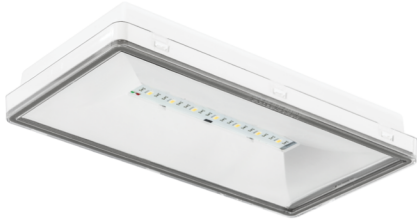
Dimensions [mm] Dimensions [mm]